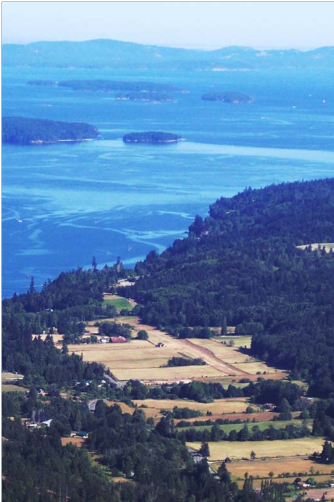
Fulford Valley on Salt Spring Island

outcome such that the character and environment of the islands is preserved. Any improvements to the quality of the cadastral fabric allows planners to make better recommendations; more accurate mapping is needed as we are required to identify and protect sensitive eco-systems, and accurately locate zoning and other planning overlays. Also, an improved fabric helps us gain public confidence in the urban planning and land conservation process on the islands, and ultimately helps garner more support for the Islands Trust mandate.”